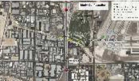
Study Characteristics (Kimbrough et al., 2012)