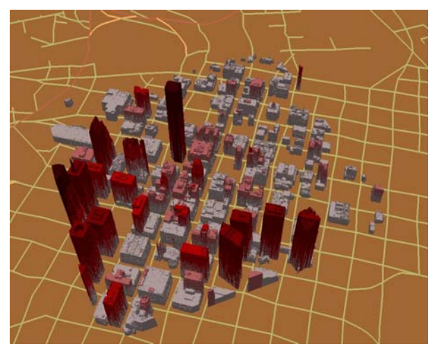
Fig. 1: Three-dimensional digital elevation data derived from an airborne lidar platform for a 1X1-km section of downtown Houston.

intensive field studies. Houston has active emissions management programs to address its substandard air quality and associated health effects. The NUDAPT prototype will include